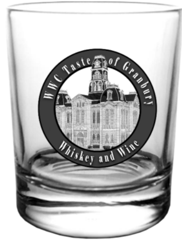
11 oz Whiskey Glass