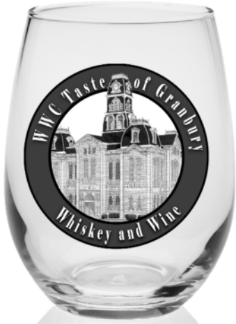
12 oz Wine Glass